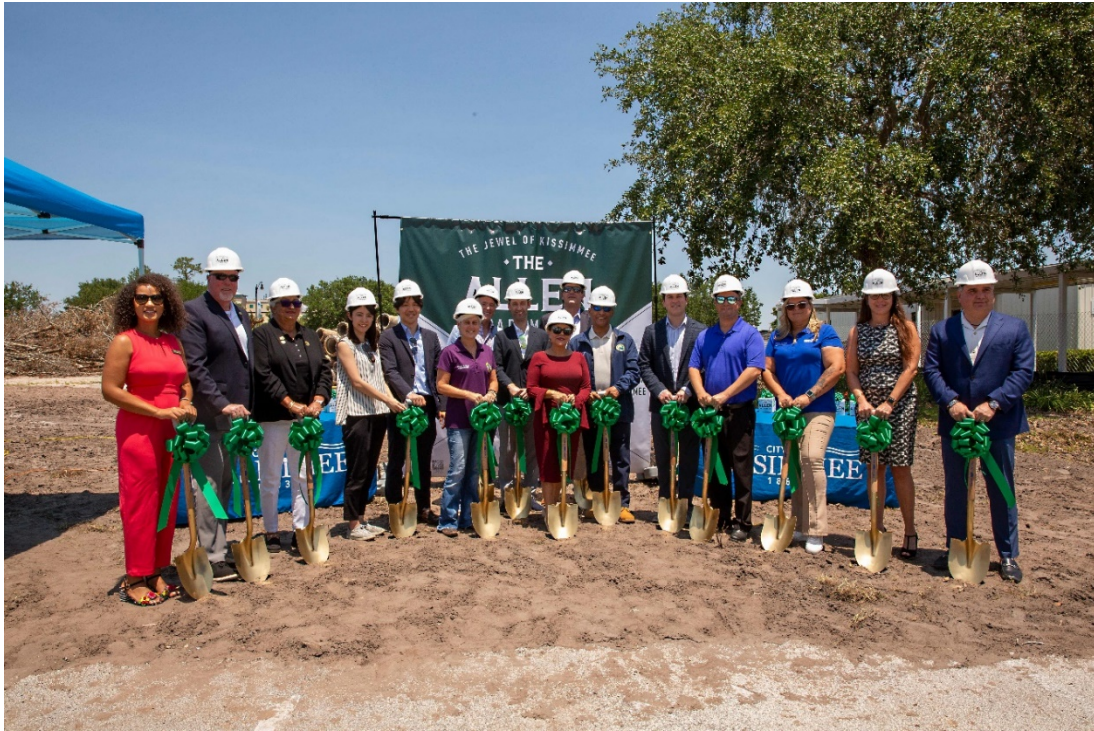
Ground Breaking Event