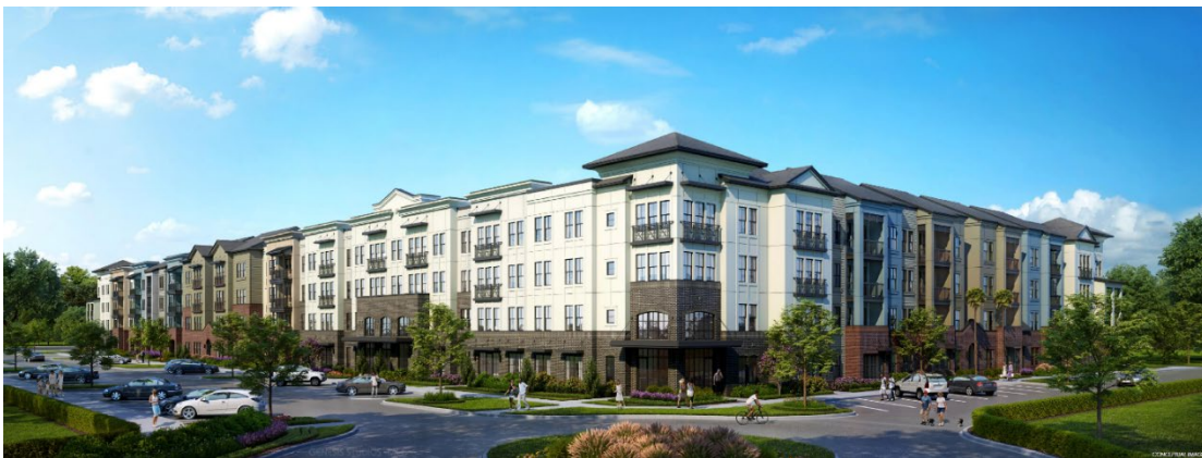
Property Exterior CGI

This project marks the company's first investment into multifamily development in the state of Florida and its second investment in the Sun Belt region, following the development in Dallas. Construction commenced in March 2023, with completion expected in 2025.